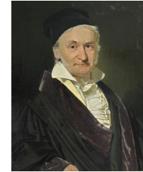
Carl Friedrich Gauss 1777-1855

A folk tale about Gauss is that he was an annoying and disruptive elementary school student, so much so, that his teacher asked him to sum all the numbers between 1-100 to distract him to get some peace and quite in the classroom.